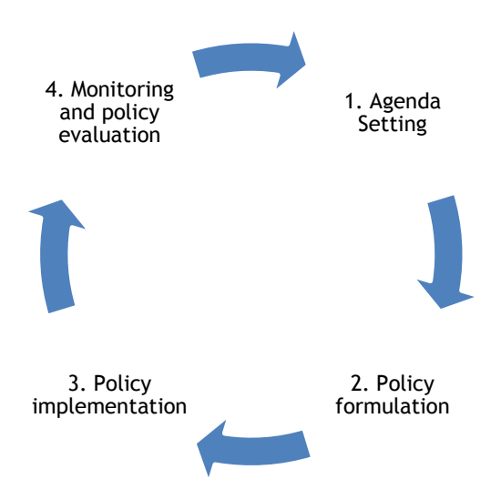
Figure 1.2.2: Simplified Model of the Policy Cycle; Source: Sutcliffe and Court (2005)